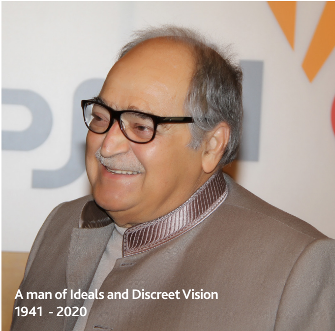
A man of Ideals and Discreet Vision 1941 - 2020

It is in a state of remorse that I write this Foreword for this issue of Al Baraka Pulse. The sad and sudden demise of our late Founder, Shaikh Saleh Abdullah Kamel, has indeed left a deep void in all our hearts. May God have mercy on him.